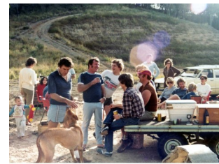
And to finish the day – a barbecue and a beer